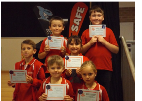
Assistant Principal Awards