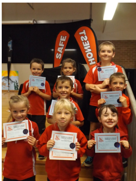
Assistant Principal's Awards