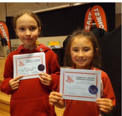
Assistant Principal's Award