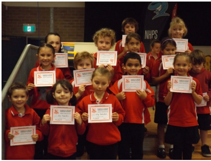
Education Week Awards - Stage 1