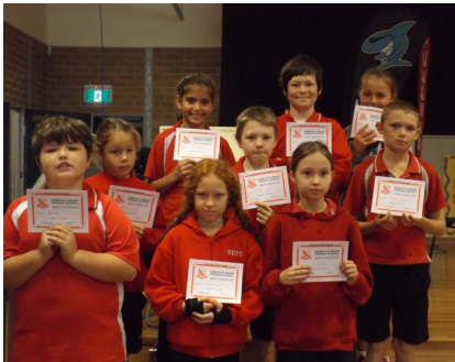
Education Week Awards - Stage 2