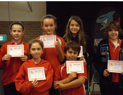
Education Week Awards - Stage 3