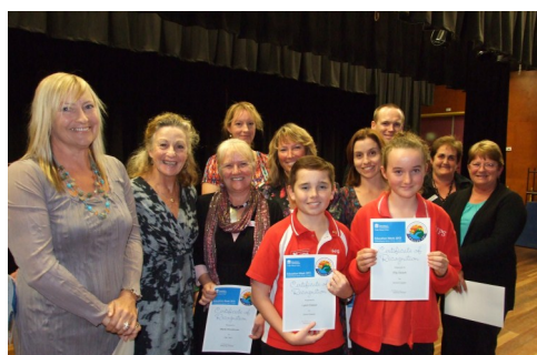
V10 Education Week Award Recipients