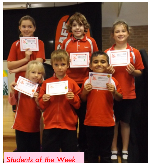
Students of the Week