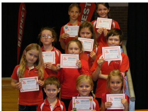
Students of the Week