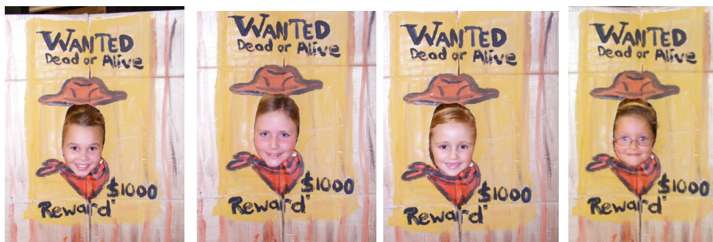
More of our "Most Wanted"

Login with the same username and password you use at school. (Don't forget to put a fullstop in between your first and surname.)