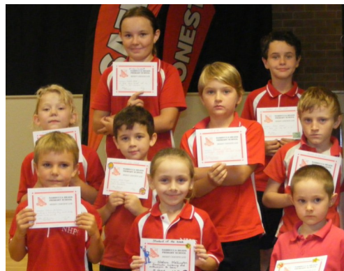
Students of the Week