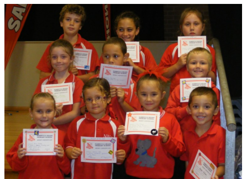
Students of the Week