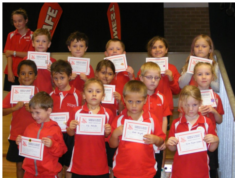
Stage 1 Award Recipients