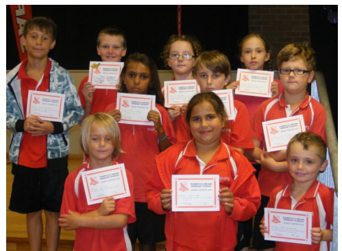
Stage 2 Award Recipients