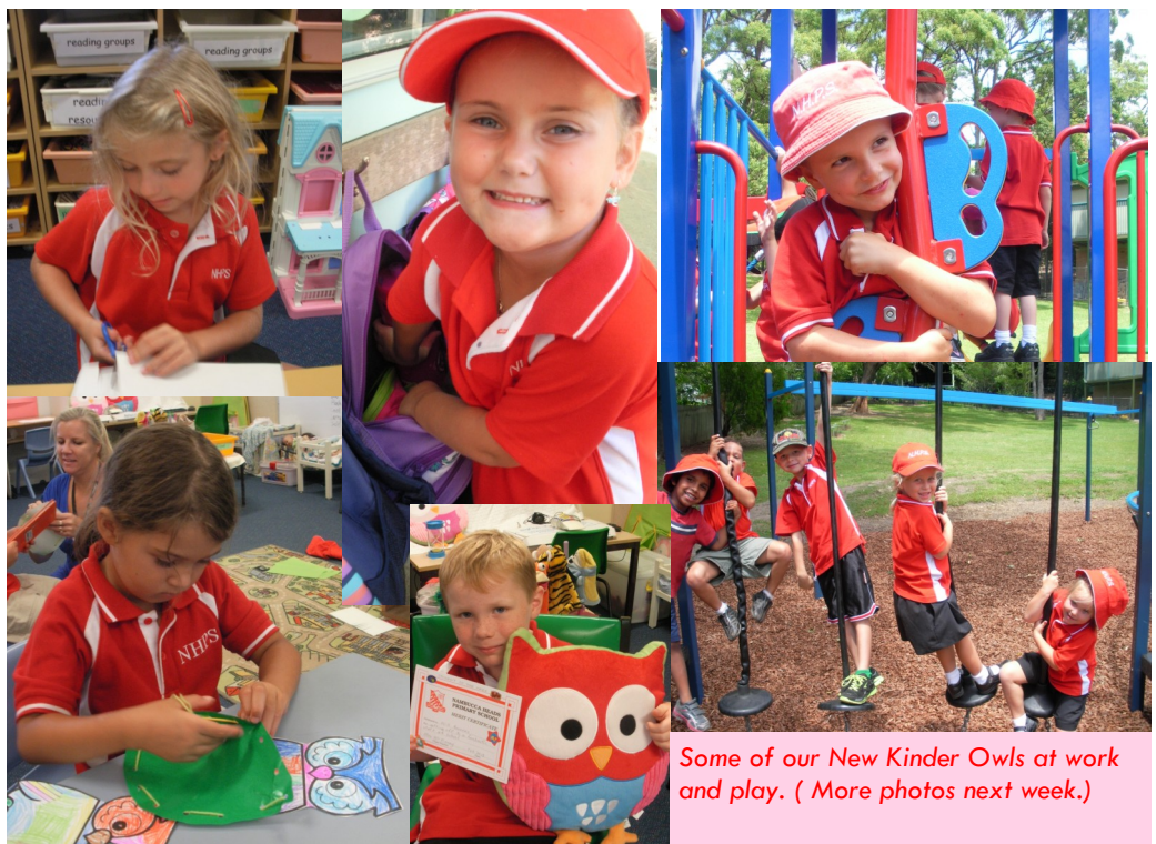
Some of our New Kinder Owls at work and play. ( More photos next week.)