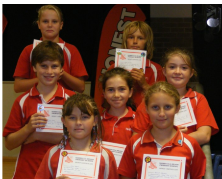
Stage 3 Award Recipients