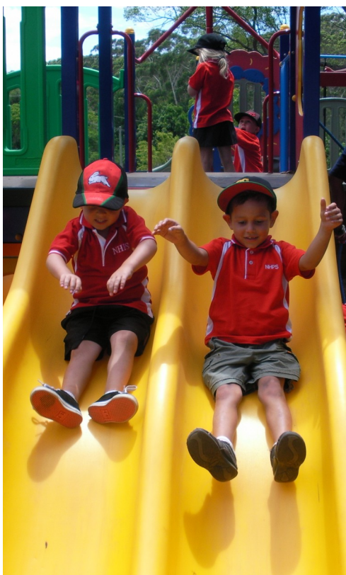
Students enjoying the Turbo Slide on our new play equipment.