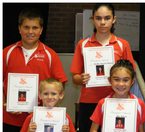
Principal's Award Recipients