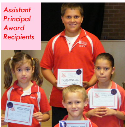
Assistant Principal Award Recipients