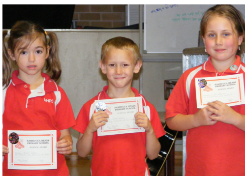
School Award Recipients