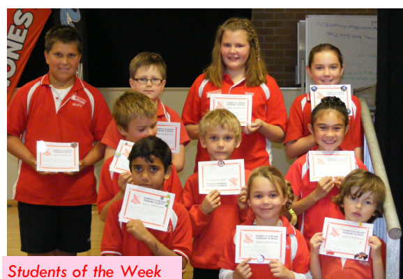
Students of the Week