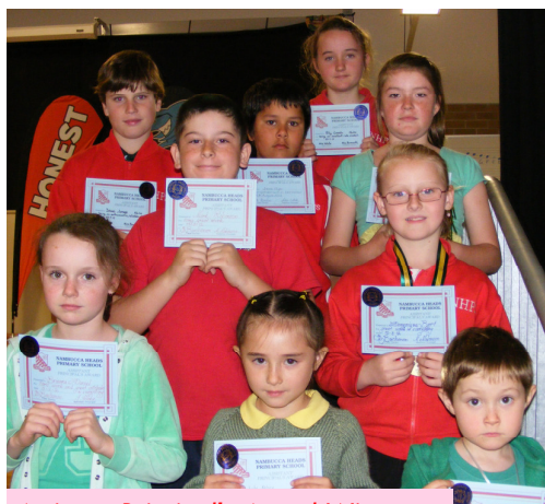
Assistant Principal's Award Winners