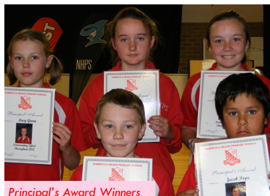
Principal's Award Winners

STAGE 3 CANBERRA EXCURSION Sun 2nd - Fri 7th Sept ONLY 2 WEEKS TO GO