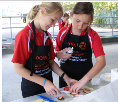
More 4-5P Master Chef Finals Photos