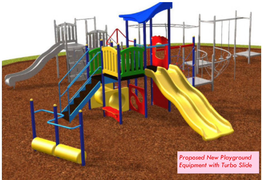
Proposed New Playground Equipment with Turbo Slide