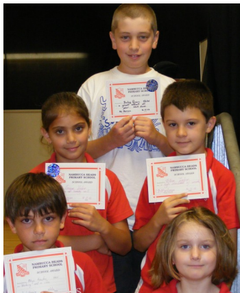
School Award Recipients