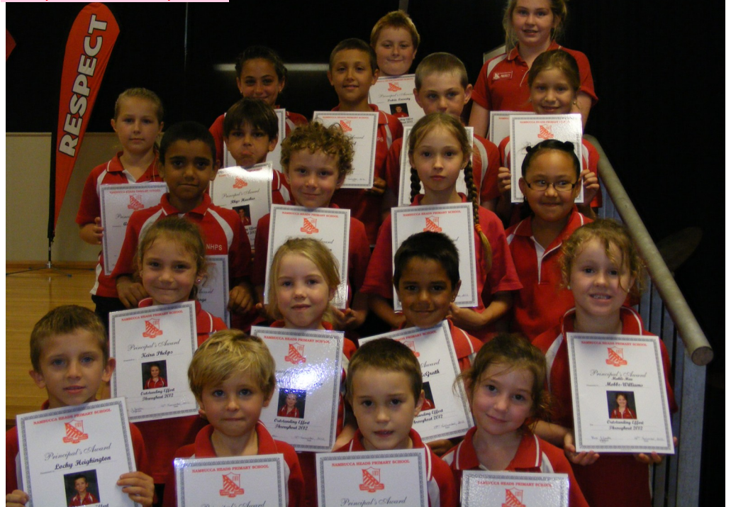
Principal's Award Recipients